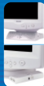
Optional Multimedia base 6G3B11